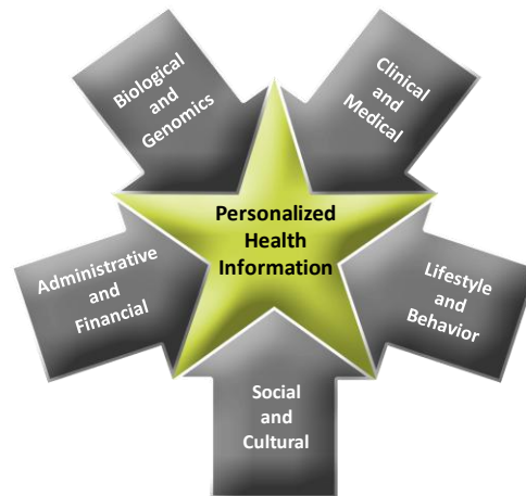
Figure 2: Integration of Individualized Health Information through PHR/EHR

Such a model maximizes patient-specific healthcare intelligence at the point of care. Additionally, it improves the Process, Performance, Participation, and Price of Care by utilizing novel analytical tools and informatics resources to provide comprehensive biological/genomics, clinical/medical, lifestyle/behavior, social/cultural, and administrative/financial patient-specific data. The data is subsequently delivered through standardized, regulatory and privacy compliant informatics platforms in a user friendly and informative manner that is easily navigated by the caregivers and understandable to the patients using mobile devices.